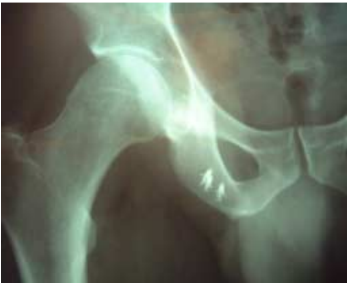
Figure 3. Stay-Tec suture in situ

After isolating the nerve, the ruptured tendons were defined from the scar tissue and tagged with No. 5 Ethibond sutures (Ethicon Inc. Somerville, New Jersey). The proximal tissue was then defined on the ischium and in only two cases were distinct tendons isolated; however, there was scar tissue present in the other cases. It was possible to implant deep sutures into this tissue but in some cases we needed to use Stay-Tec sutures (Zimmer, Inc., Warsaw, Indiana) into the bone (Fig. 3). These sutures were then passed through the proximal end of the distal tendon. In every case we had to flex the knee to 90° in order to oppose the ruptured tendon ends to the ischium.