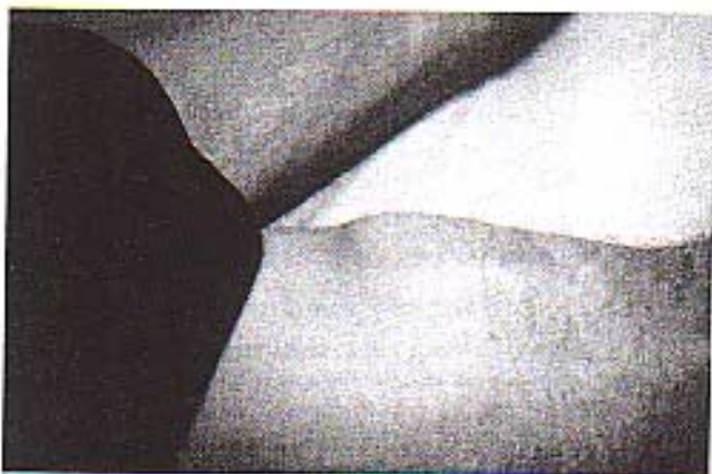
Figure 1. A preoperative clinical photograph of the patient in the prone position shows a palpable mid-posterior-thigh mass and proximal hamstring defect

Leg weakness was stated as the main reason for seeking medical attention, with two patients complaining of difficulty with leg control while walking downhill and sic complaining of difficulty with running. Two of the patients complained of significant sciatica as well. When first seen at our medical centre, each patient had a posterior midhigh mass and palpable gap. These symptoms were accentuated by having the patient perform a hamstring muscle contraction in the prone position (Fig. 1). Clinical examination revealed gross weakness of knee flexion and in all cases a palpable gap accentuated with muscle contraction and accompanied by a muscle bulge was seen. Radiographs demonstrated no bony lesion from the ischium in any of the patients. Magnetic resonance imaging (MRI) has been employed in the last five cases but was unavailable in the earlier cases (Fig. 2). This imaging method helps to define the rupture anatomically.